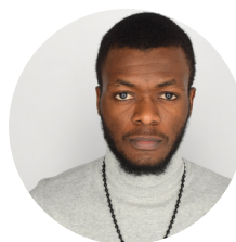
Banjo Edu Recruiter, Technical Talent